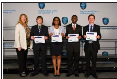
SUBR Special Awards for Excellence Biomedical Research-Intel ISEF 2011

for the top biomedical projects that best demonstrate the goal of advancing human and/or veterinary medicine. Science Service, in partnership with the Intel Foundation, announces awards at the Intel ISEF Special Awards Ceremony each May. Student winners are ninth through twelfth graders who earned the right to compete by winning top prize at a local, regional, state or national science fair.